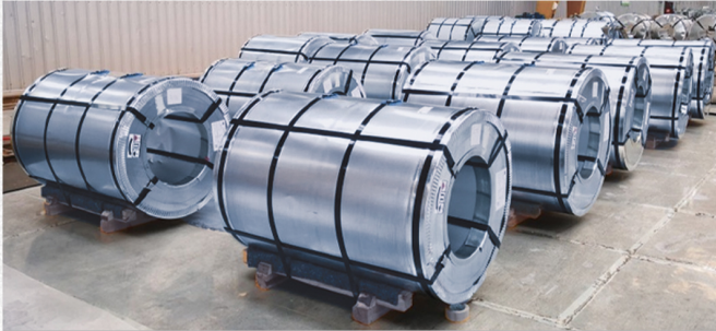
Galvalume Wider Coil

Featuring advanced technology and a distinctive blue hue, SEL Tiger Azure promises exceptional strength and endurance. The commitment to meticulous engineering and cutting-edge design makes it an ideal choice for robust construction plans.