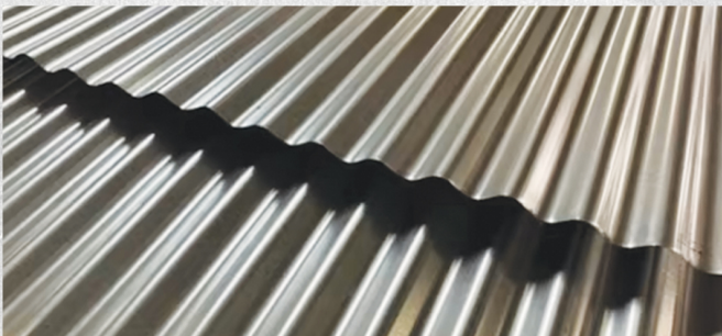
Galvalume Corrugated Sheets

With advanced coatings for all-weather protection, Alfa sheets are engineered for offering unmatched performance for affordable roofing solutions.