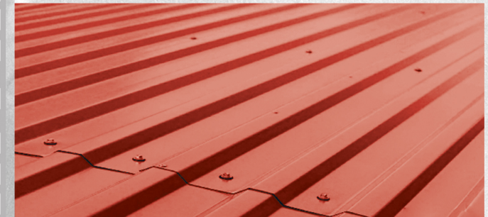
Premium Color Coated Sheets

Quality, durability, and value harmoniously come together. Superior protection against the elements to ensure that we surpass your expectations.